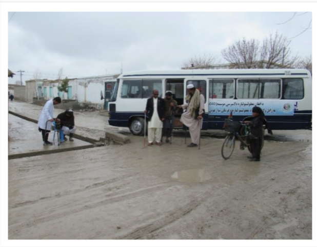
AOAD emergency Physical Rehabilitation activities in Zabol project funded by WHO