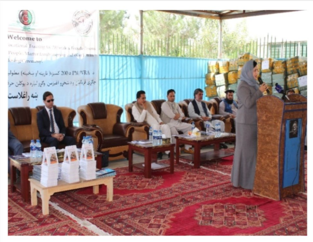
Certificates and tools kits distributed by AOAD Director and guests after the one-year training of the vocational training project funded by PM/WRA