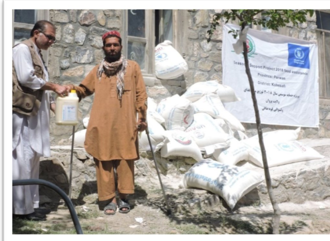
Inclusion of Persons with Disabilities in foods distribution project funded by WFP in Parwan implemented by AOAD.