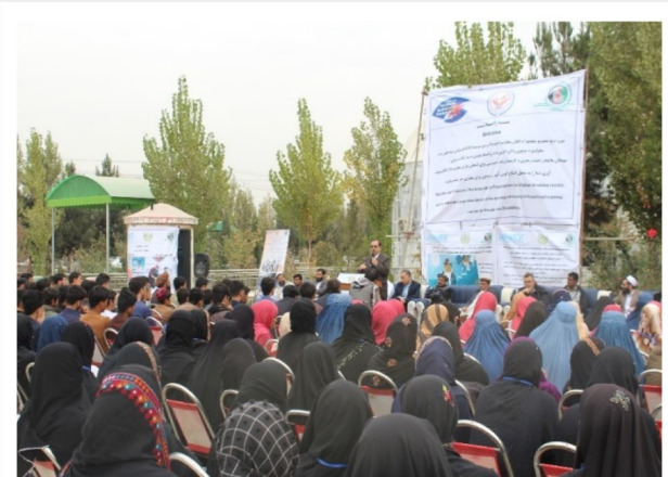
Physical Accessibility vocational training skills development project opening ceremony in Kabul on September 3, 2019 and project funded by PM/WRA.