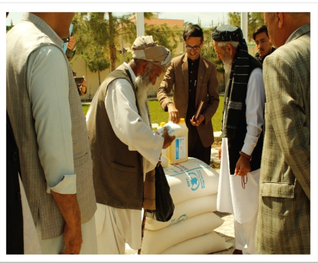
Inclusion of Persons with Disability, Seasonal foods distribution in Logar province by AOAD funded by WFP.