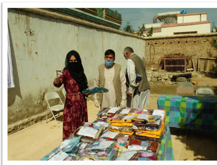
AOAD distributed Eid clothes to men/women/girls with disabilities in Kabul project funded by PM/WRA