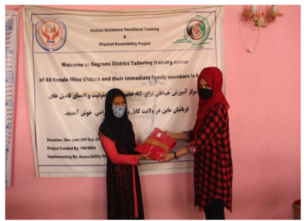
AOAD vocational training center in Kabul General Electrician and Tailoring training for women/girls with disabilities