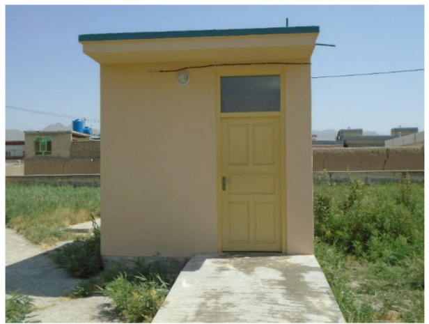
AOAD improved Physical Accessibility with building Accessible Washroom for Wheelchairs users.in Kabul in 9 public building.